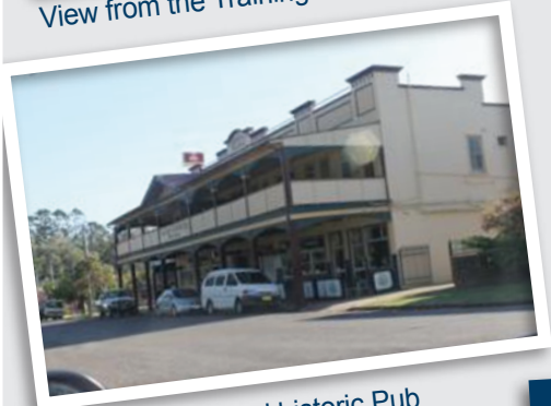
Dinners at the local historic Pub